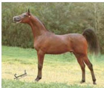
TOP Island Elegance’s sire, Couturier . MIDDLE ROW Island Mist with Ellie as a foal. BOTTOM Island Shamrock , full brother to Island Elegance.