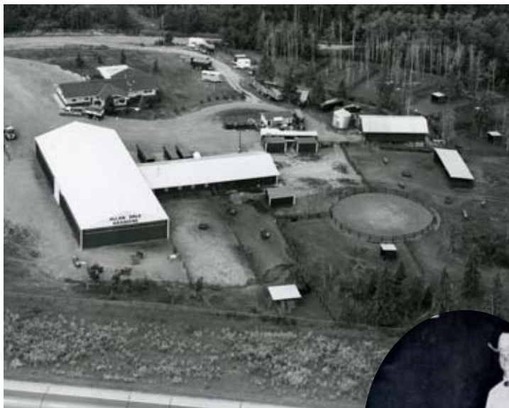
ABOVE The Allan Dale property in the 1970's. The highway is visible in the bottom left. Later, the words on the barn would be changed to read 'Allan Dale Arabians & Llamas'.

Proud Silver surpassed Witezon’s one hundred purebreds with one hundred and seventy-eight of his own. He sired four winners