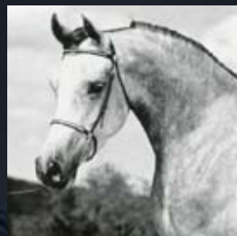
Zareba ( Witezon Zarzon x Na-Zeba ), born 1972. She is the dam of eleven foals including Lady Tornado and Silverette, the grand-dam of a Top Ten winner.