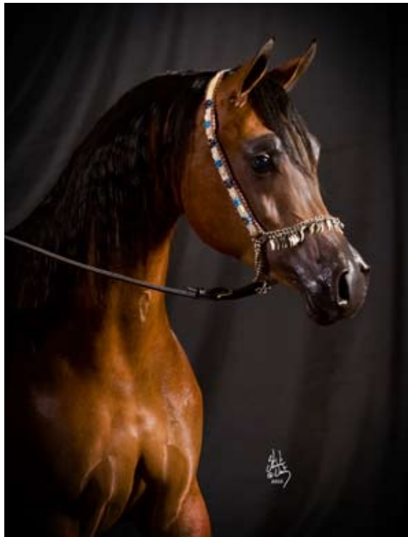
ABOVE Marwanna AD ( Marwan Al Shaqab x Cibylla El Yllan ), 2008 bay filly. Marwanna AD was fourth in the 2010 Las Vegas World Cup Junior Mare Supreme Championship, after winning Reserve Champion in her section. She was sold to Australia and sold again to Saudi Arabia just prior to the start of the World Cup.

Now that sounds like sound advice for any era. 🐾