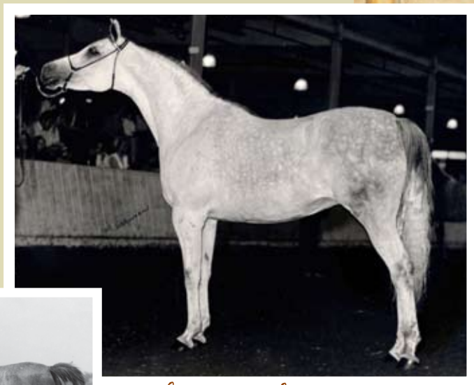
Serenity Shahra (Antar x Sheherezade)