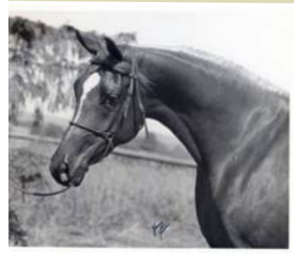
SF Bint Sonbolah (*Khofo++ x *Serenity Sonbolah)