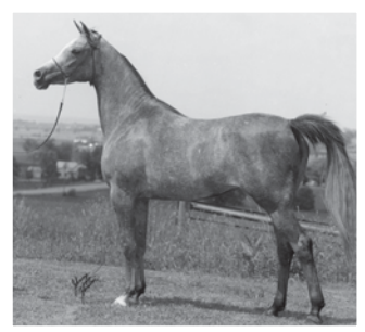
Serenity Bt Shahra (*Khofo++ x *Serenity Shahra)